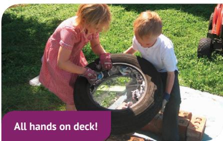
All hands on deck!

Lowther also have four boys from a local private secondary school who visit weekly to help out, which is invaluable. The school is always trying new and creative ways to get more hands on deck.