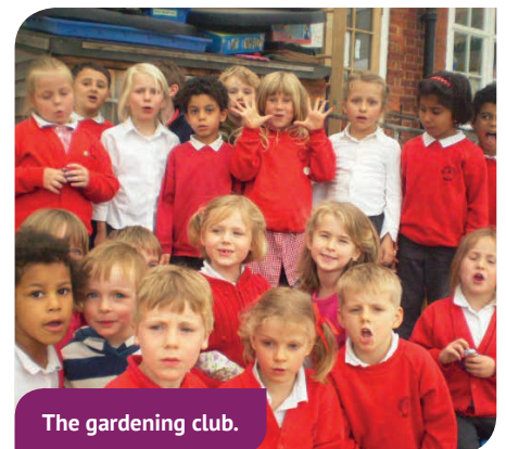
The gardening club.