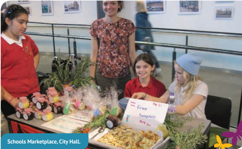
Schools Marketplace, City Hall.