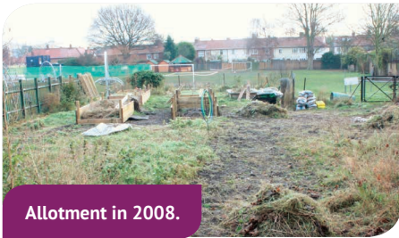
Allotment in 2008.