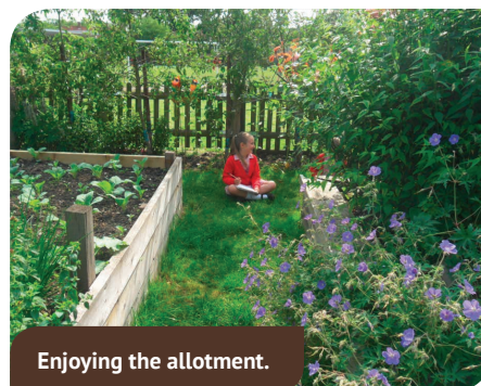
Enjoying the allotment.

The partnership runs events and training workshops which could kick-start growing in any London school. Visit the website for more information: www.foodgrowingschools.org